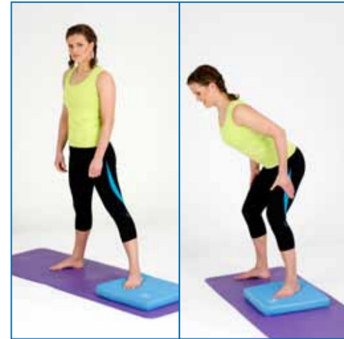
Warm-up: Marching on the AIREX® Balance-pad Elite